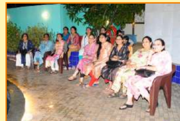
Song & Dance at Windsong Resort, Ratnagiri 9th December 2023