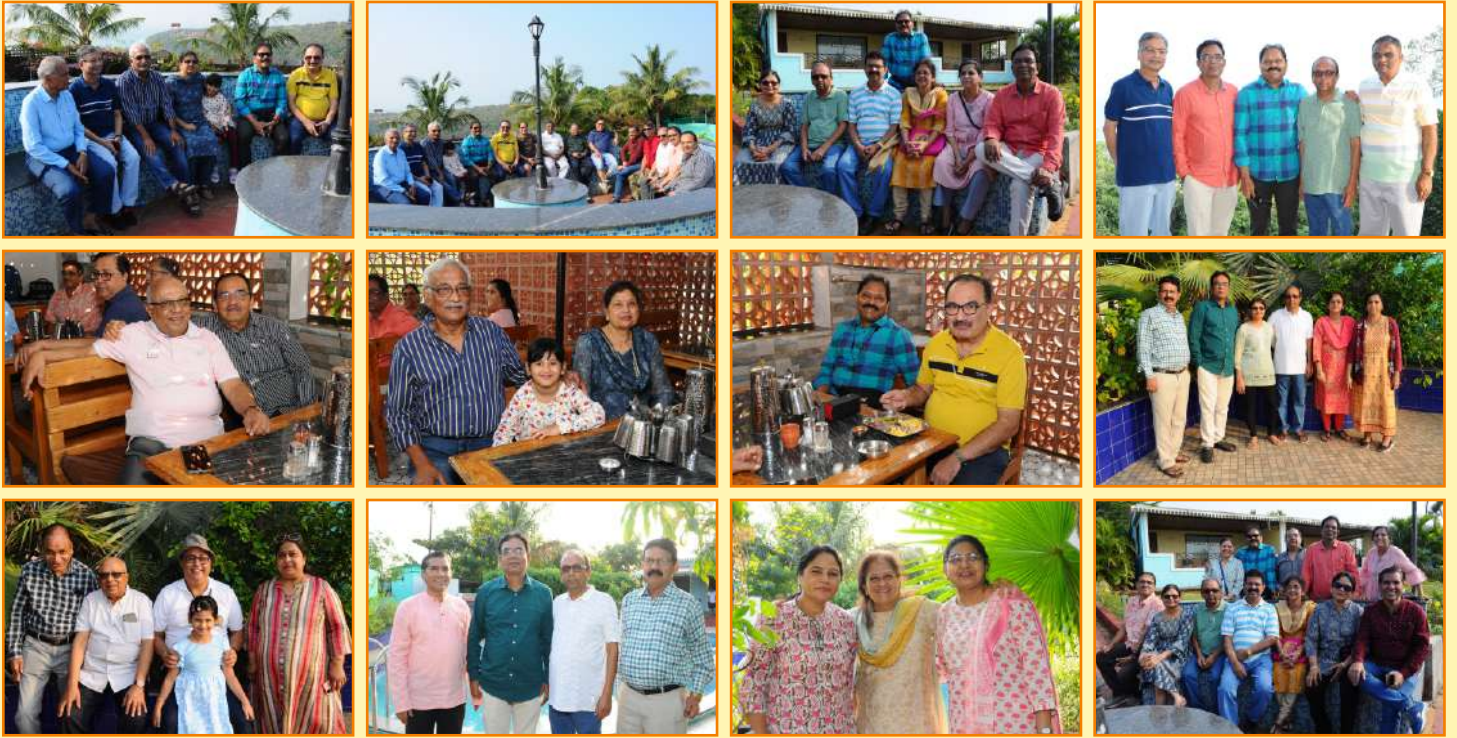
Windsong Resort 10th December 2023