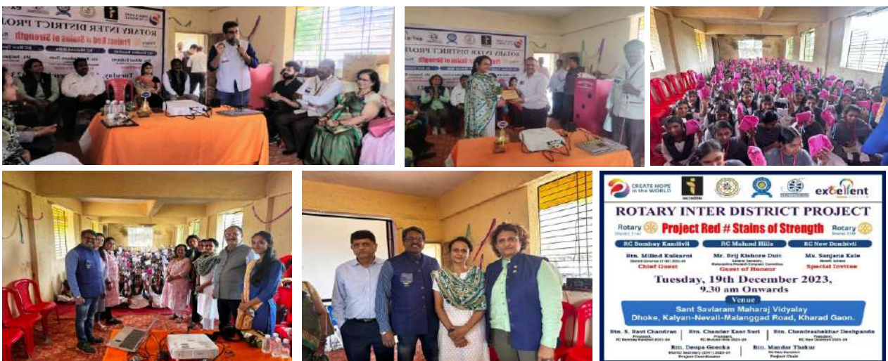
19th December 2023 Project Red - Distribution of Menstrual Hygiene Kits to Girl students of Sant Savlaram Vidyalaya at Kharad Gaon. CSR Support - India Factoring.