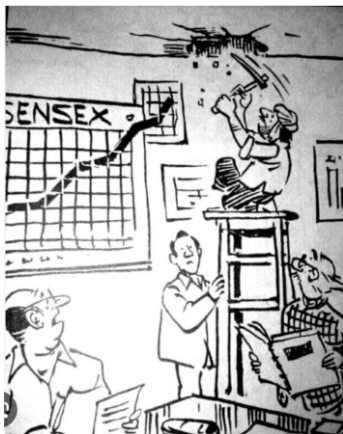
Sensex touching roof !