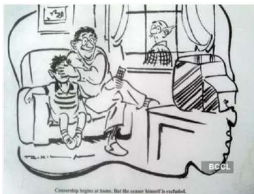
Censorship begins at home, censor himself is excluded !