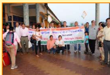
Ratnagiri Railway Station- End of Tour 12th December 2023