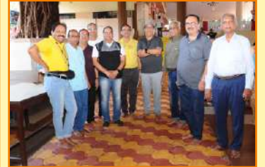
Mahakali Temple at Adivare 9th December 2023