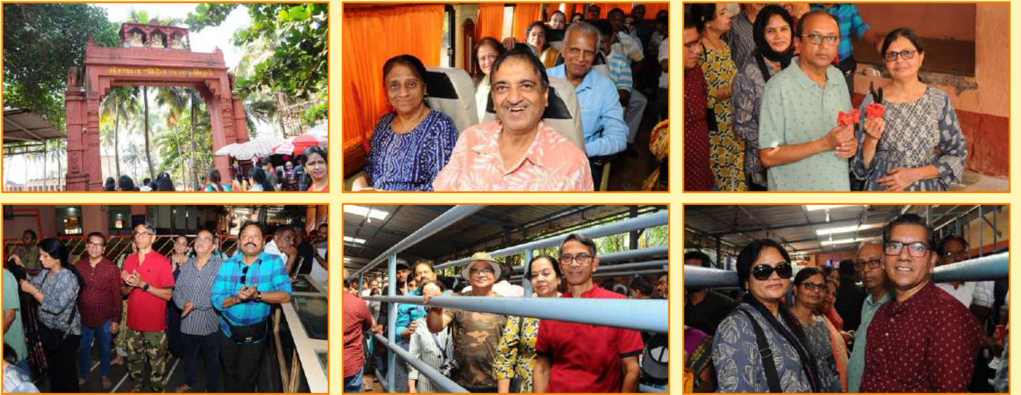
Ganpatipule Darshan 10th December 2023