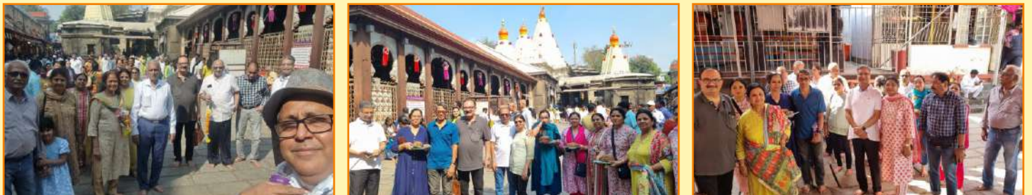
Mahalaxmi Temple Darshan 11th December 2023