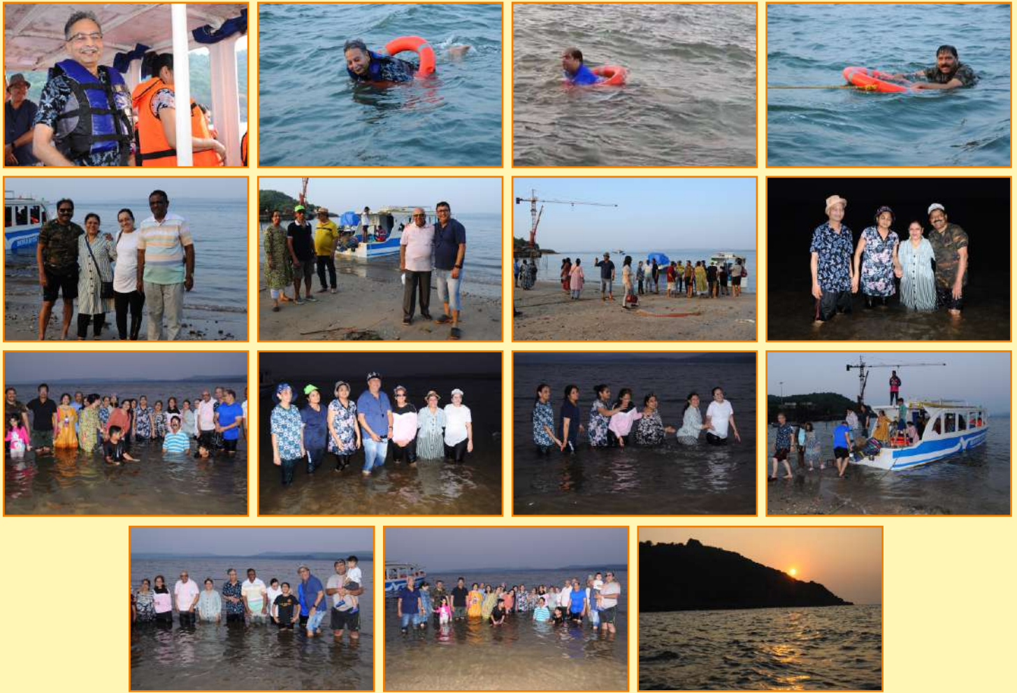
Beach & Boat Riding at Ratnagiri 10th December 2023