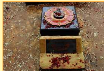
Pawankhind Visit 12th December 2023