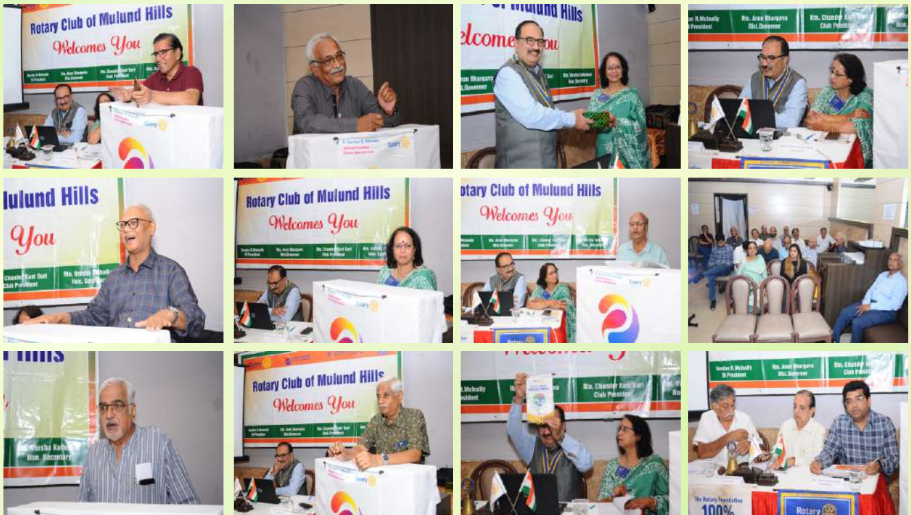
15th December 2023. Annual Meet of Club at Hotel Sitara. Election results for President Elect and office bearers of 2024-25 announced. Annual Meeting of Trust followed.