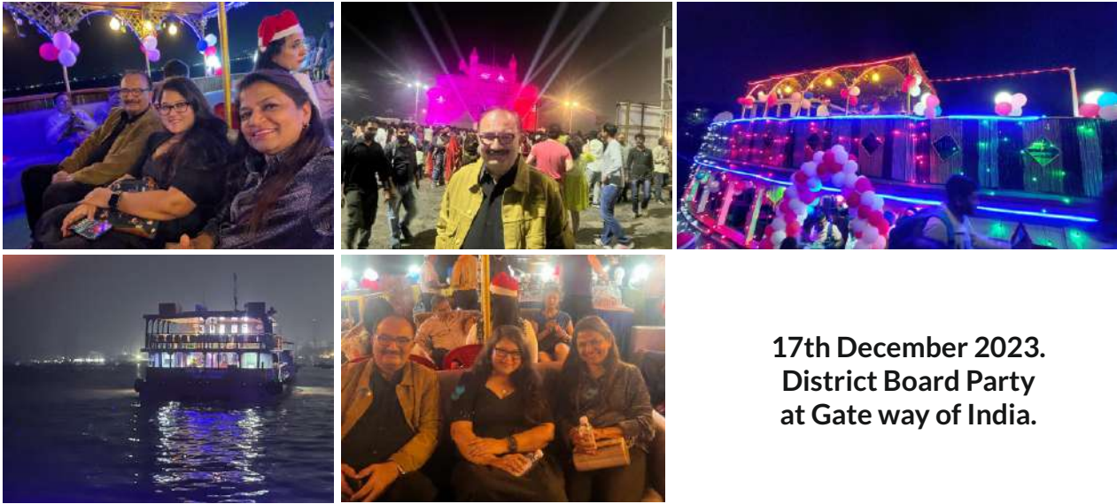
17th December 2023. District Board Party at Gate way of India.